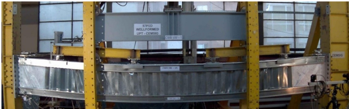
Fig. 2: SW1 CWB Beam during the test